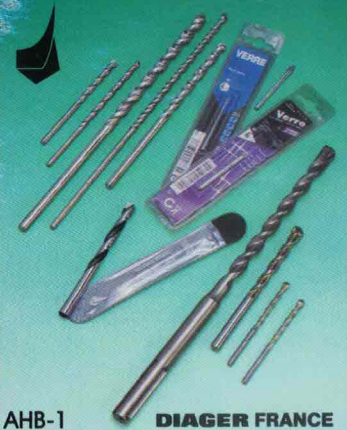
AHB-1 DIAGER FRANCE