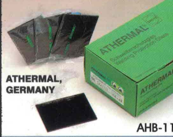
AHB-11 ATHERMAL, GERMANY