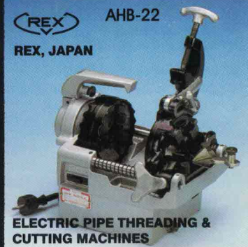
AHB-22 REX, JAPAN