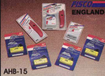
AHB-15 FISCO ENGLAND