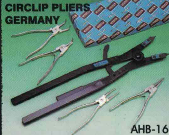
AHB-16 CIRCLIP PLIERS GERMANY