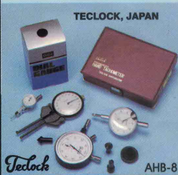
AHB-8 TECLOCK, JAPAN