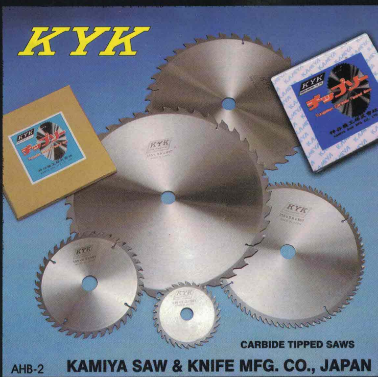
AHB-2 KAMIYA SAW & KNIFE MFG. CO., JAPAN