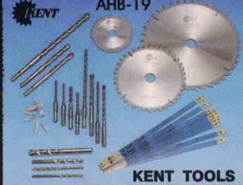
AHB-19 KENT KENT TOOLS