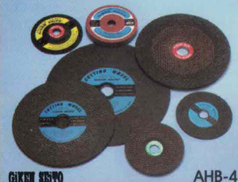
AHB-4 GIXEN S&P