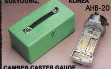
AHB-20 SUKYOUNG, KOREA