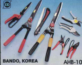
AHB-10 BANDO, KOREA