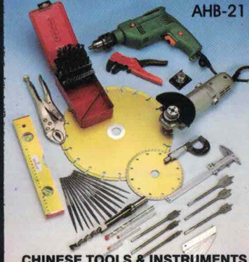
AHB-21 CAMBER CASTER GAUGE