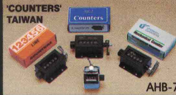
AHB-7 'COUNTERS' TAIWAN