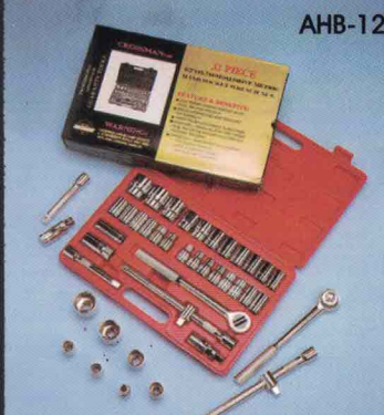
AHB-12 CROSSMAN & ACTION, TAIWAN