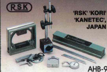
AHB-9 'RSK' 'KORI' 'KANETEC', JAPAN