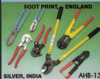
AHB-13 FOOT PRINT, ENGLAND