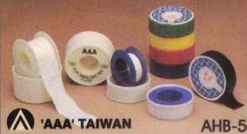
AHB-5 'AAA' TAIWAN