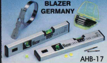
AHB-17 BLAZER GERMANY