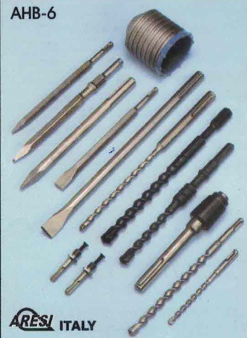
AHB-6 ARES ITALY